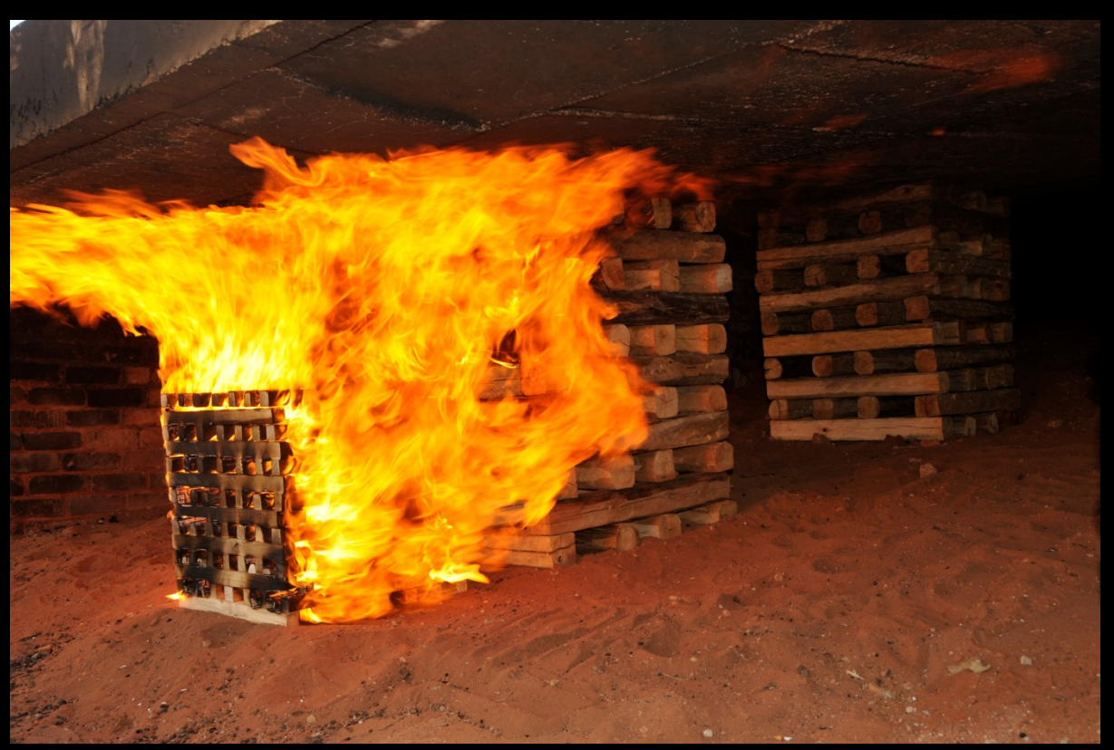
Stope test on Timber Mine Supports